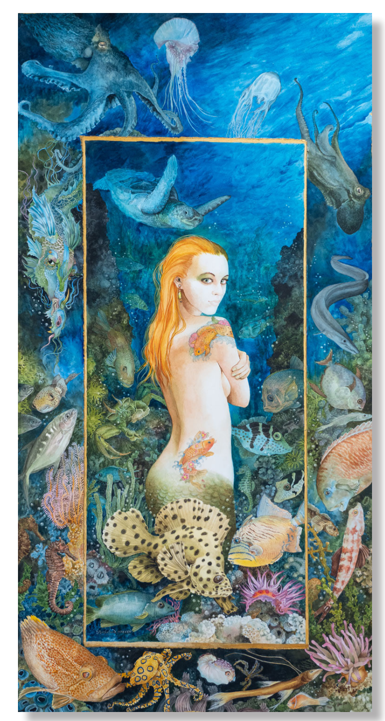
Mermaid "Come down and see me some time . . ." Watercolour, 105 cm x 52 cm $4800