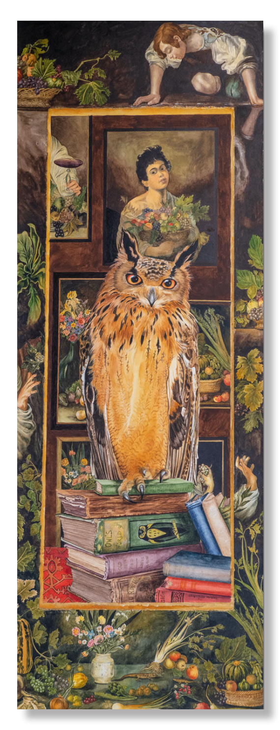
A night with Carravagio Watercolour, 104 cm x 39 cm $3500