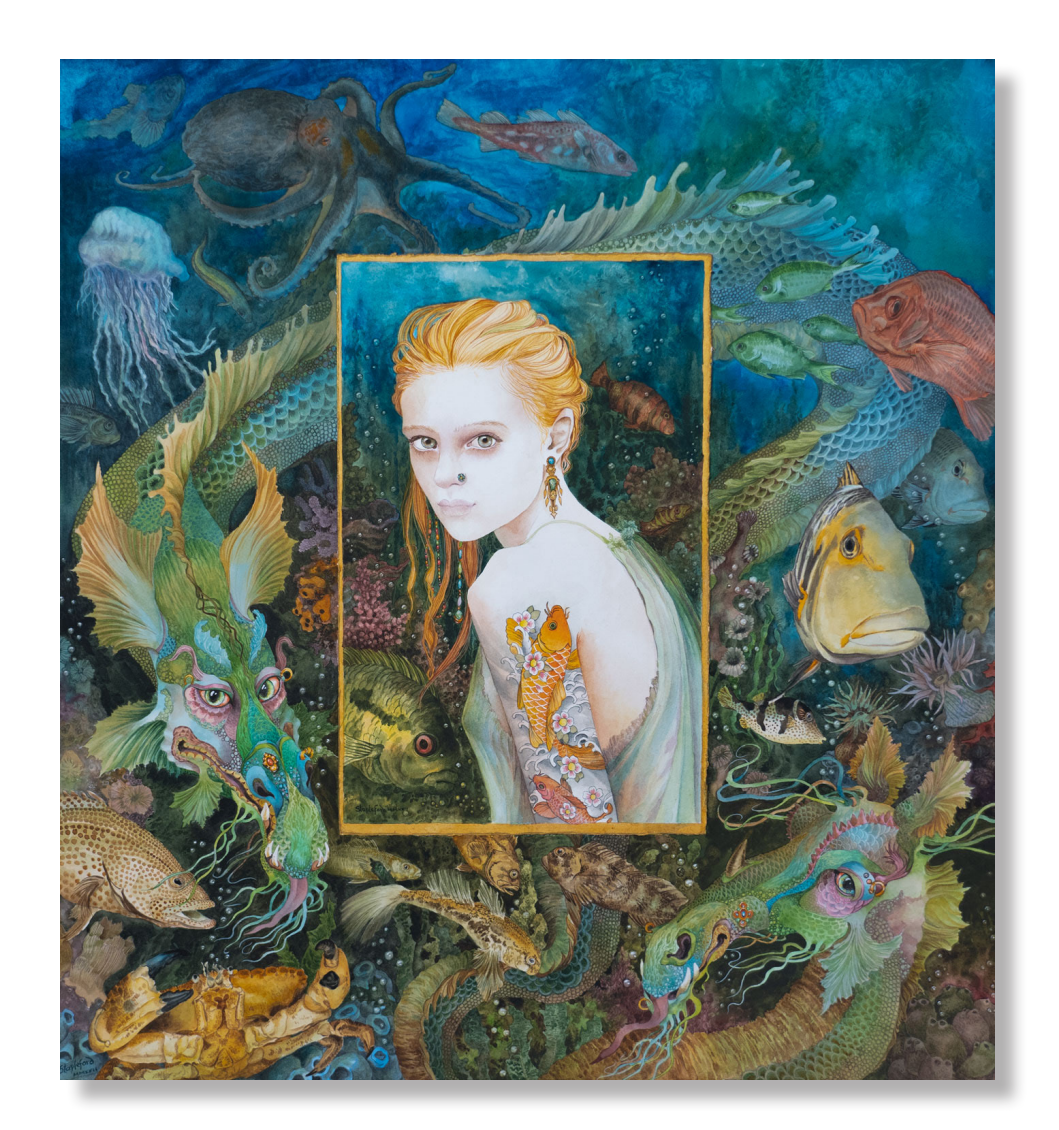
Mermaid "Found you in an ocean's depth, as thus loved . . ." Atilla Ilhan Watercolour, 58~\text{cm} \times 56~\text{cm} $3000