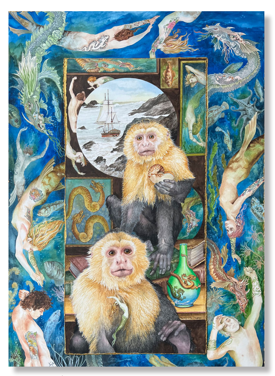
Dancing with Dragons Watercolour, 105 cm x 64 cm $5500