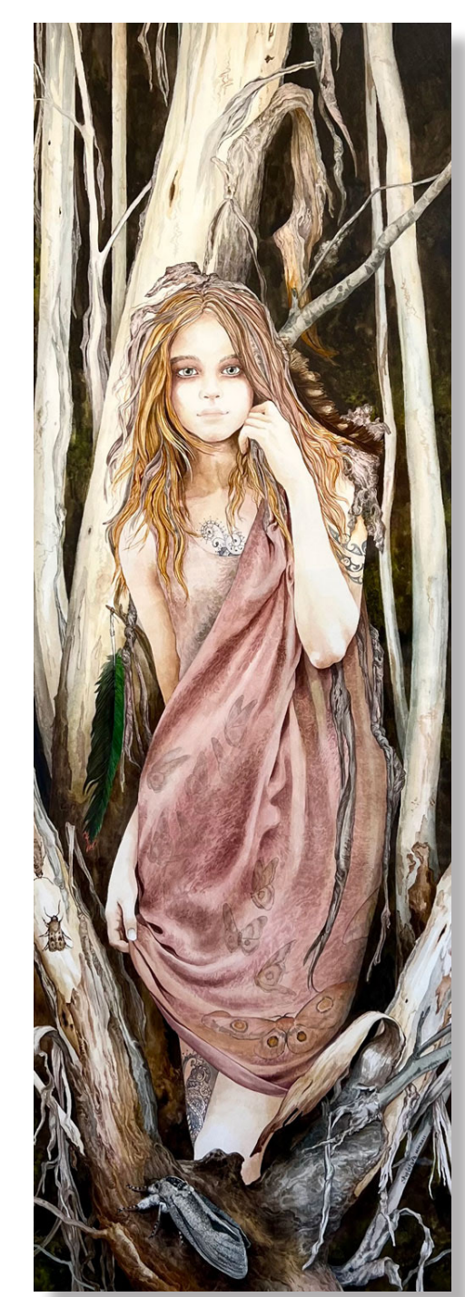
Moth Spirit Watercolour, 103 cm x 34cm $3200