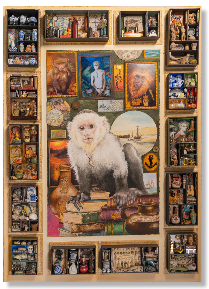
Pirate's Monkey and the cabinet of curiosities Watercolour, 97 cm x 67 cm $4800