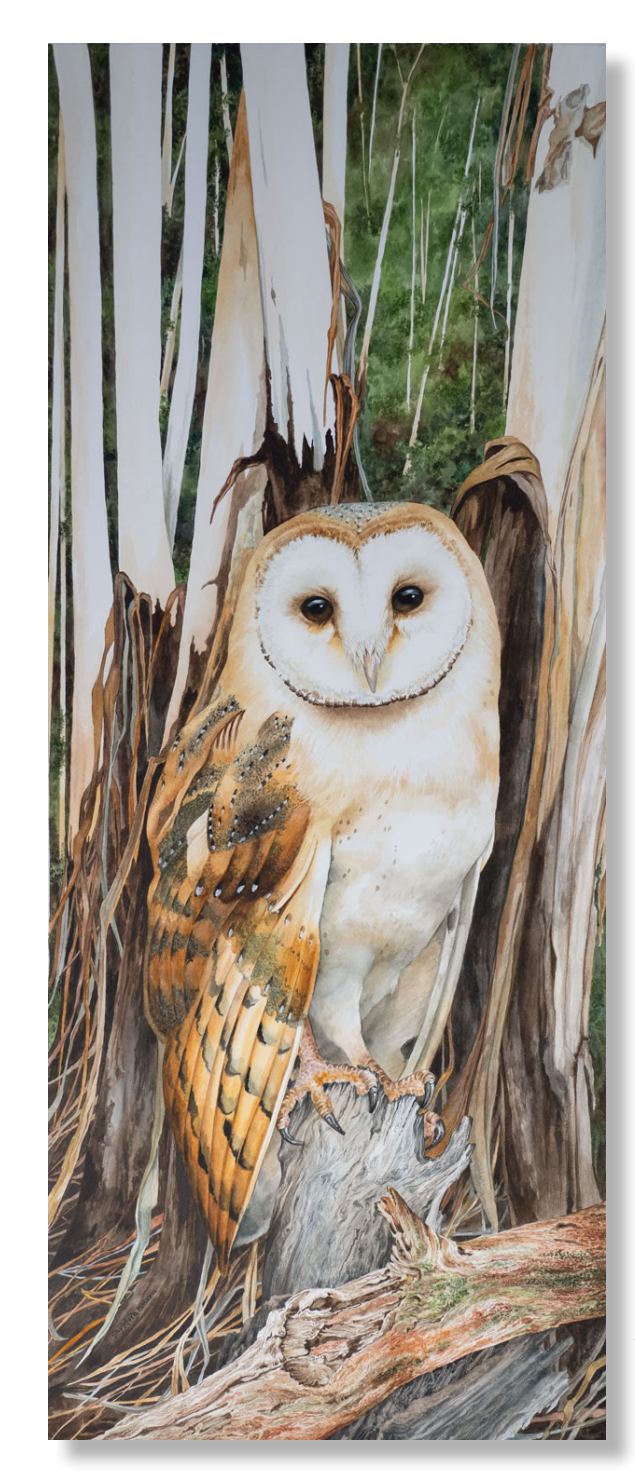
Ghosts Watercolour, 105 cm x 38 cm $3200