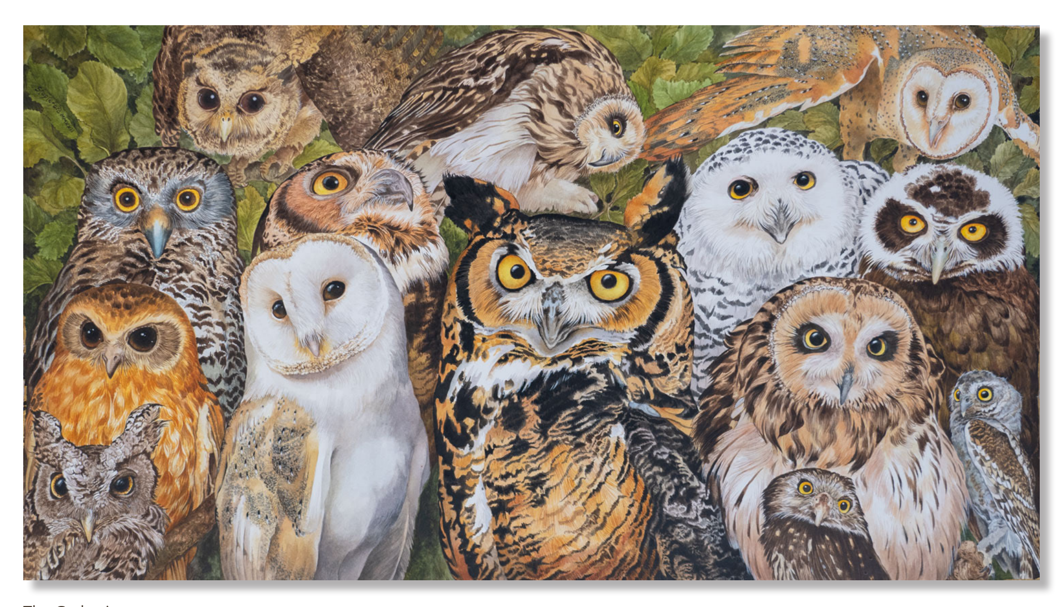
The Gathering Watercolour, 46 cm x 76 cm $4400