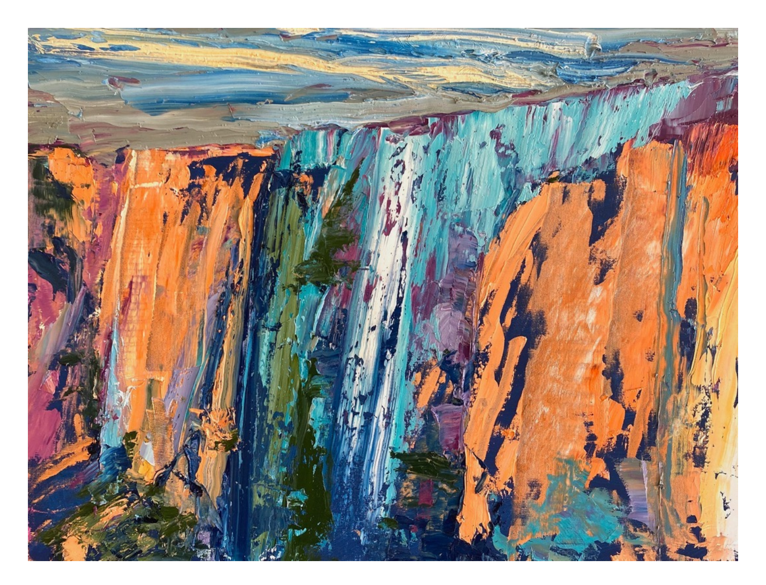
Rainbreak 63 x 94 cm . Oil on linen . Tasmanian Oak frame