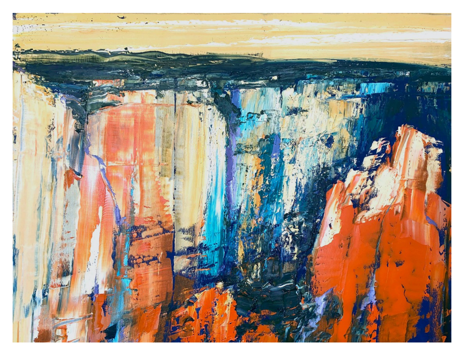
Chasm 122 x 152 cm . Oil on canvas