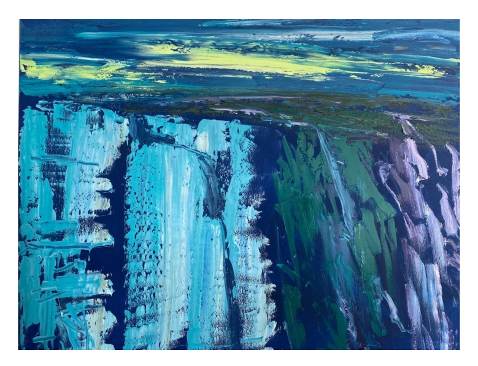
Moonlight Blue 1 102 x 122 cm . Oil on canvas