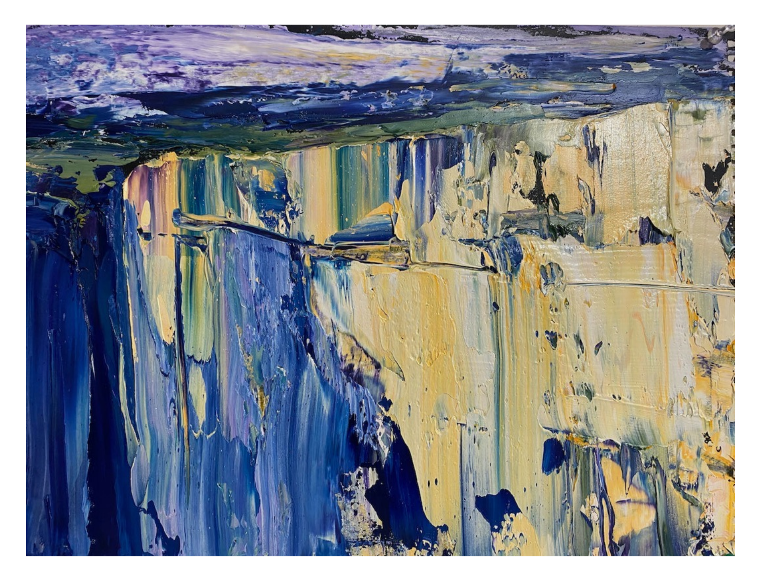
Sharp Light 31 x 41 cm . Oil on paper . Tasmanian Oak frame with glass