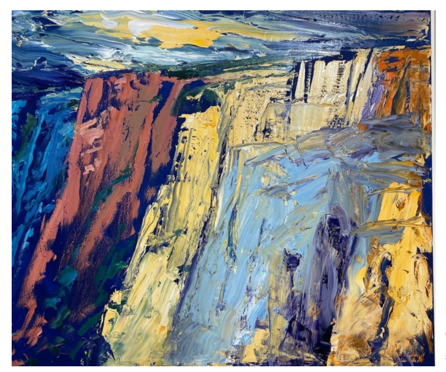
Bright Clouds 102 x 122 cm Oil on canvas