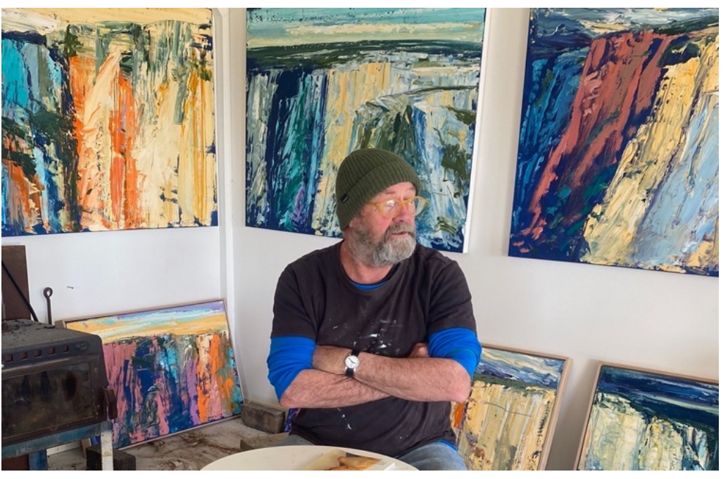
Front Cover Image Approaching Storm | 122 x 152 cm | Oil on canvas | $ 6,800