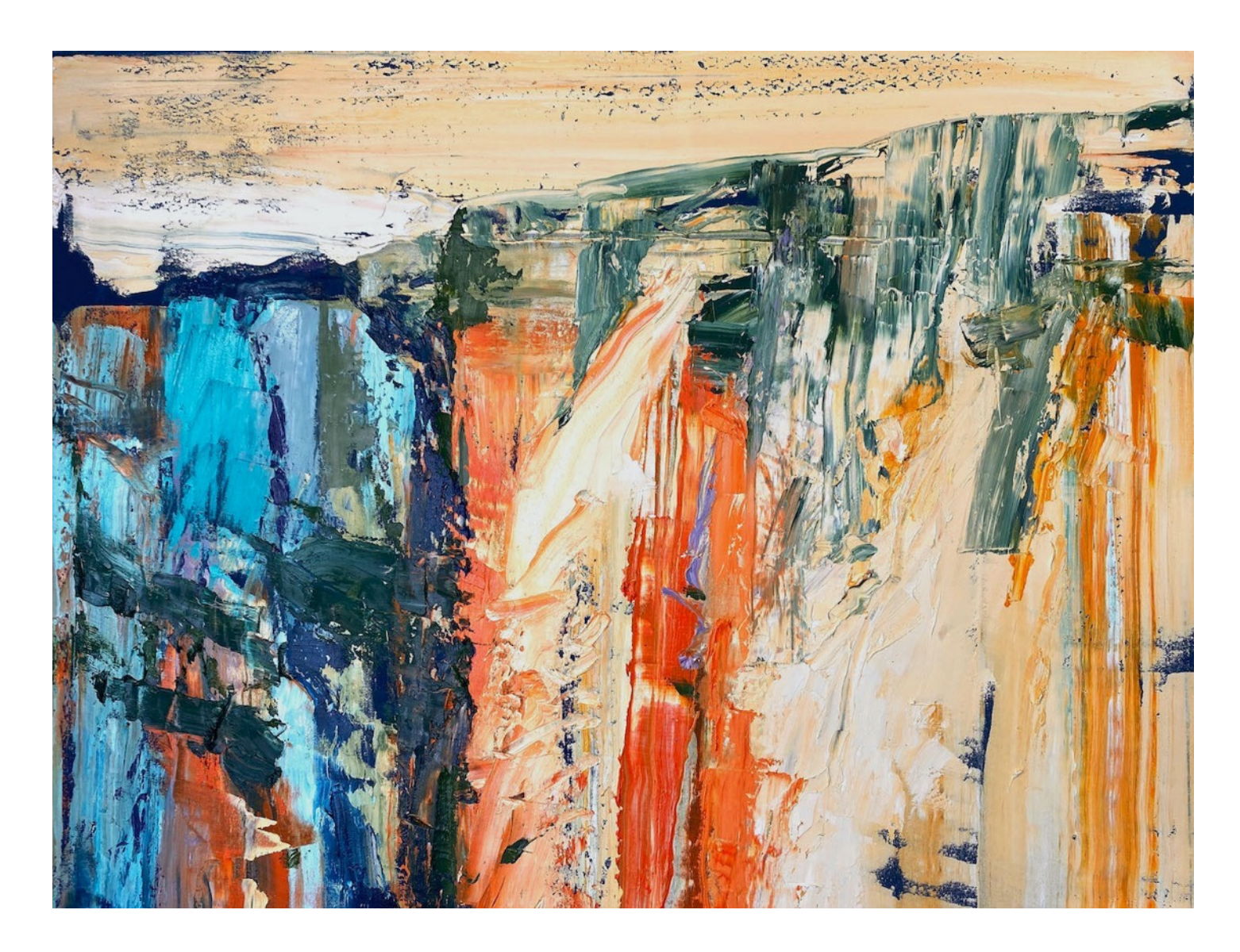
Highcliffs 102 x 122 cm . Oil on canvas