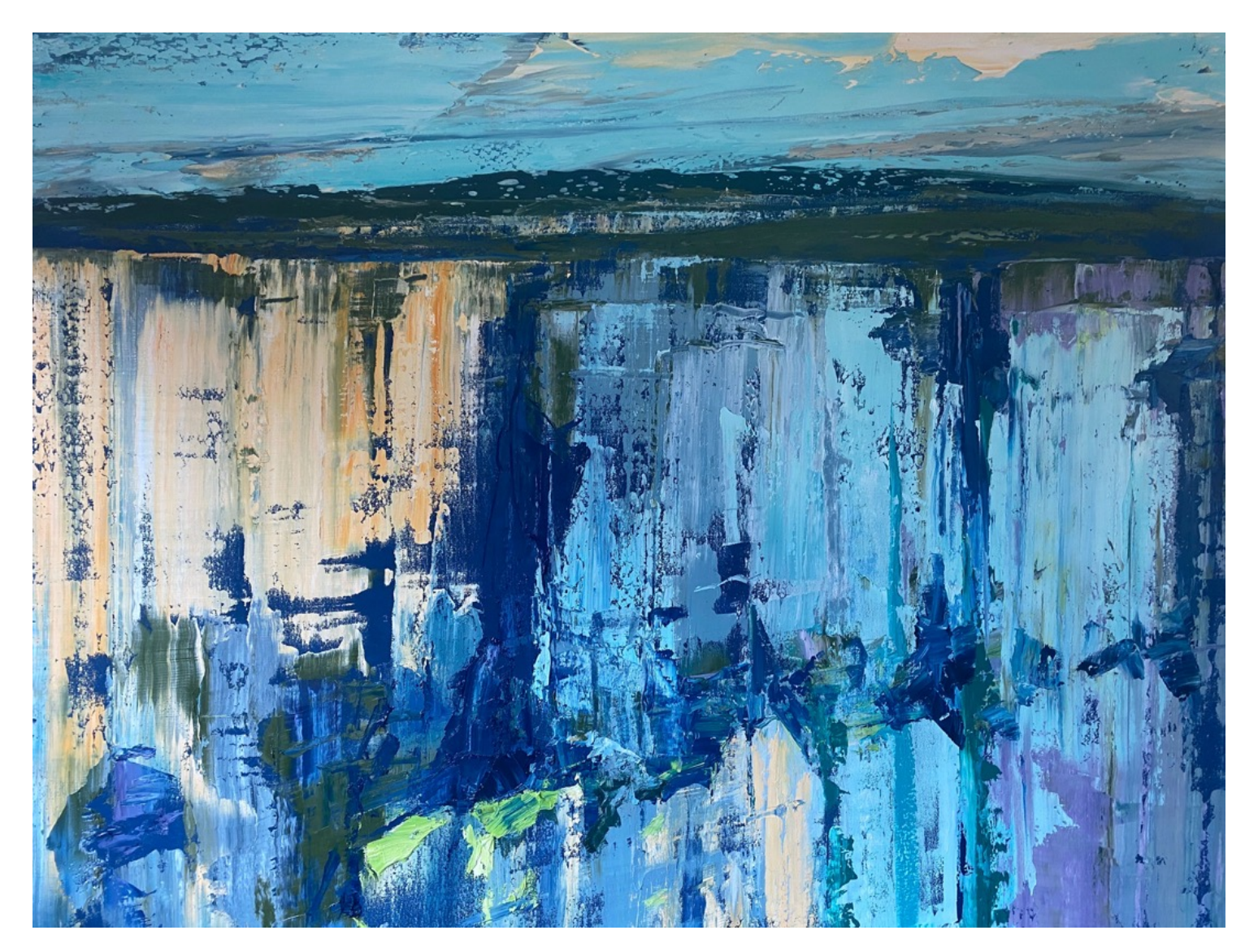
Blue Light Wall, Dusk 122 x 152 cm . Oil on canvas