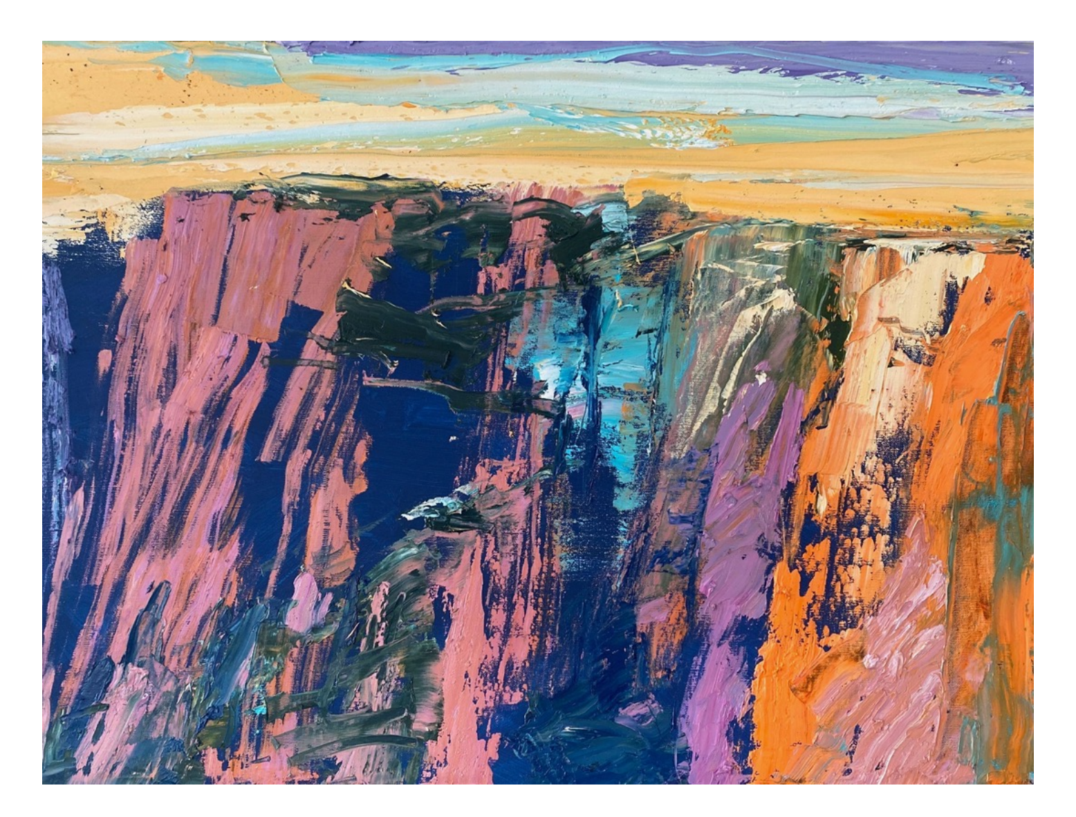
Pink Bluff 63 x 94 cm . Oil on linen . Tasmanian Oak frame